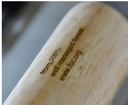
Marking on wood