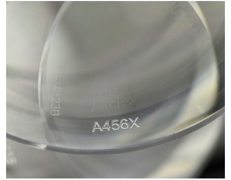
Marking on labels