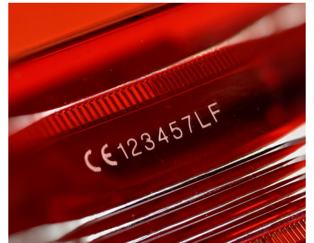
Glass & transparent plastics