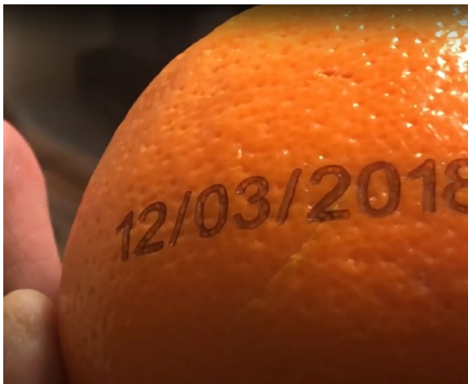
Fruits & vegetables marking