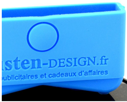
Non-contrasted marking on plastics